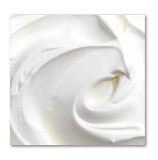
Hokkaido Fresh Cream

Our rich and aromatic fresh cream is made from the highest quality fresh milk. We have it delivered from an extensive production area in Hokkaido.